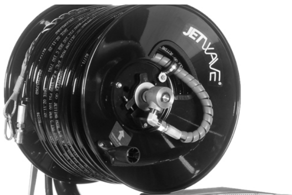
Figure.15 - Brake Adjustment

The optional hose reel is equipped with an adjustable brake to prevent the hose from playing off the reel under its own weight. Tightening wingnut increases the drag on the reel, loosening decreases the drag. Adjust as desired. The brake only works in one direction (to resist hose moving off reel) (Figure 15).