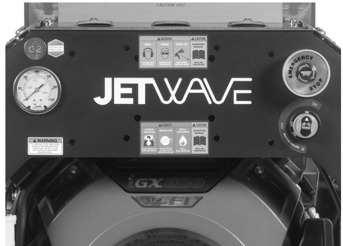
Figure.4A - Senator G2 Warning Labels

If any problems are found, do not use the unit until the problems are corrected.