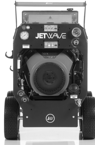
Figure.2 - Senator G2 Cold Water Petrol High Pressure Cleaner with optional trolley kit