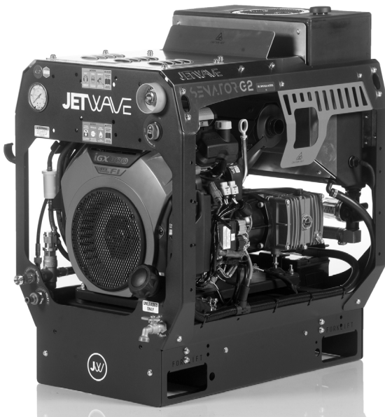
Figure.1 - Senator G2 Cold Water Petrol High Pressure Cleaner

The Jetwave® Senator™ G2 engine powered High Pressure Cleaner machine is a portable unit designed to use a combination of water pressure and flow to clean different surfaces from dirt, grease, & grime. Water is pumped through the high pressure plunger pump at increased pressure and flow allowing water to be used at such high pressure to remove dirt and grime from surfaces. The Senator™ G2 High Pressure Cleaner is equipped with a gasoline HONDA™ engine to drive the triplex plunger pump.