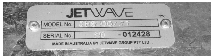
Figure.3 - Machine Serial Number

See the Jetwave® catalog for specific equipment supplied with each catalog number.