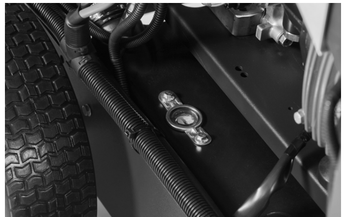
Figure.4B - Senator G2 Fuel Level Gauge

Clean water filter (Figure 5). Using the drain valve, drain the tank. Unscrew the clear plastic bowl cover anti-clockwise and remove and clean the mesh filter (note: ensure the o-ring is set back into place before screwing plastic bowl back on). Dirt and debris can restrict the water flow to the pump and cause performance issues.