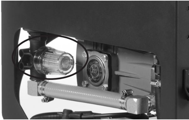
Figure.5 - Senator G2 Water Filter