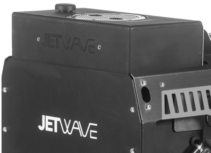
Figure.6 - Senator G2 Bypass Tank

Use care when routing hoses. Routing hoses over rough surfaces, sharp edges, crossing hoses, etc. can damage the hose jacket. Keeping the unit hose on the reel(s) will help to minimize hose damage.