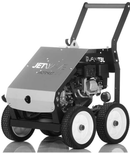
Figure.2 - Hornet G2 Jnr Petrol High Pressure Cleaner

The Jetwave® Hornet™ G2 engine powered High Pressure Cleaner machine is a portable unit designed to use a combination of water pressure and flow to clean different surfaces from dirt, grease, & grime. Water is pumped through the high pressure plunger pump at increased pressure and flow allowing water to be used at such high pressure to remove dirt and grime from surfaces. The Hornet™ G2 High Pressure Cleaner is equipped with either a gasoline HONDA™ engine or a KOHLER™ diesel engine to drive the triplex plunger pump.