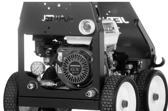
Figure.4a - Hornet G2 Jnr Warning Labels

Clean water filter (Figure 5). Unscrew the brass cover from bottom of the filter and remove and clean the mesh filter. Dirt and debris can restrict the water flow to the pump and cause performance issues.