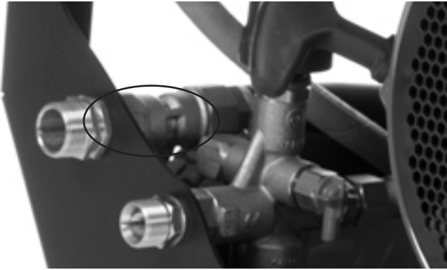
Figure.5 - Hornet G2 Water Filter