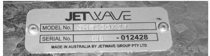
Figure.4 - Machine Serial Number

See the Jetwave® catalog for specific equipment supplied with each catalog number.