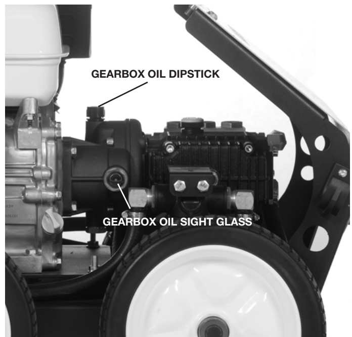
Figure.16a - Checking Pump and Gearbox Oil Level G2 Jnr