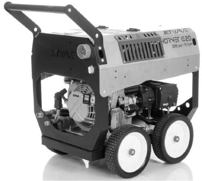
Figure.3 - Hornet G2D Diesel High Pressure Cleaner - Electric Start