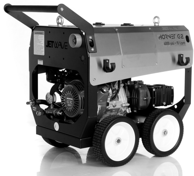
Figure.1 - Hornet G2 Petrol High Pressure Cleaner - Pull Start