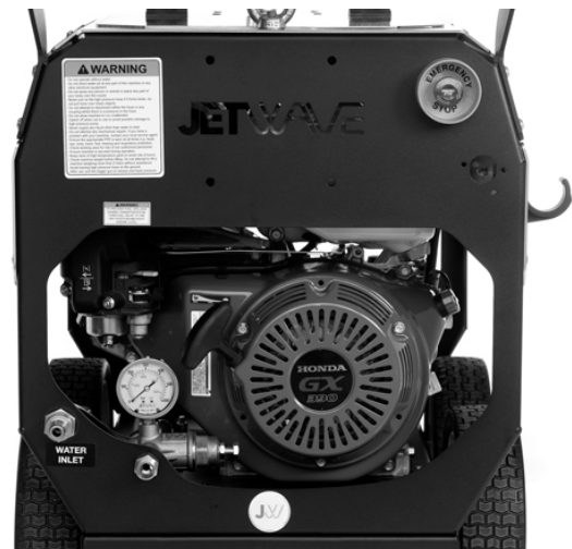
Figure.4 - Hornet G2 Warning Labels

If any problems are found, do not use the unit until the problems are corrected.